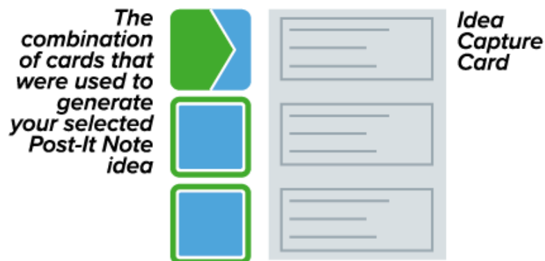
Figure 3: Sample intervention design card layout