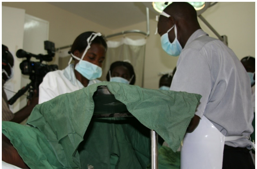
Journalists film a circumcision procedure during a site tour organized by the Male Circumcision Consortium at the Universities of Nairobi, Illinois, and Manitoba (UNIM) Research and Training Center in Kisumu.