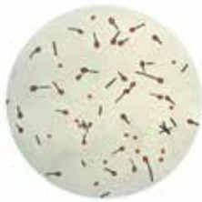
Fig. 2. C. tetani bacteria and spores