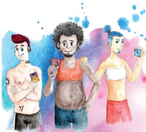
First national booklet concerning the health of transmen

CARTILHA DE PREVENÇÃO COMBINADA DO HIV PARA HOMENS TRANS