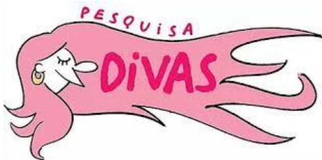
Pesquisa DIVAS: first RDS on transwomen data