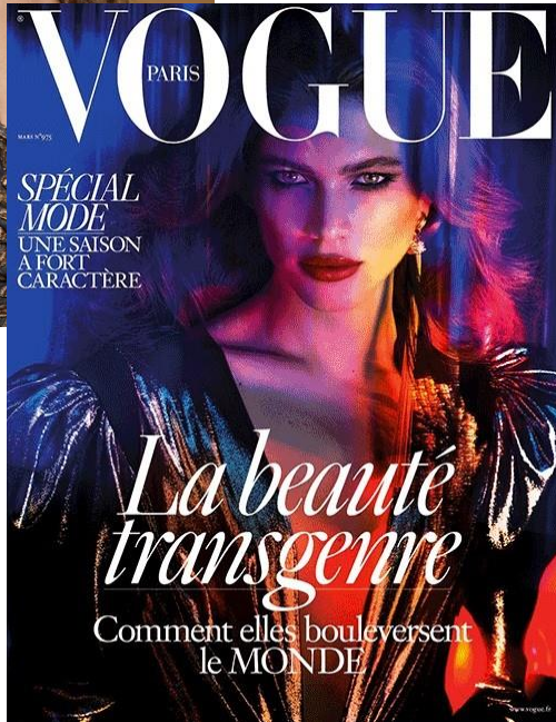
Valentina Sampaio World's first transwoman to be on the cover of Vogue Paris magazine