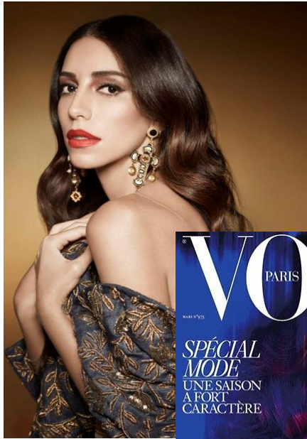
Lea T Transwoman who worked for Givenchy