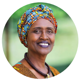
Winnie Byanyima, Executive Director, UNAIDS - TBC