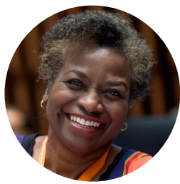
Natalia Kanem, Executive Director, UNFPA