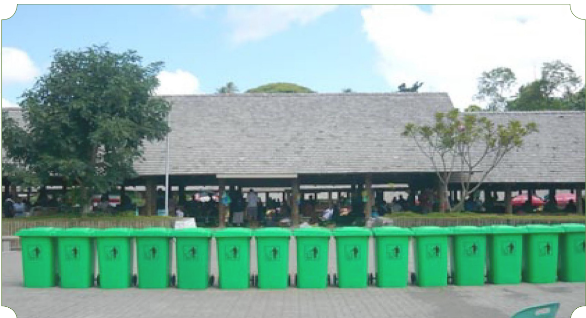
Kokopo Market: A Healthy Market setting